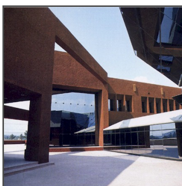
Centro de Investigación y Desarrollo Condumex

The path of GRUPO CONDUMEX has been characterized by our interest on technology research and development. CIDEC (Centro de Investigación y Desarrollo Condumex) was created to support this purpose, an institution of technological excellence oriented to the creation of new products, compounds and materials, design, continuous improvement and development of processes and systems.